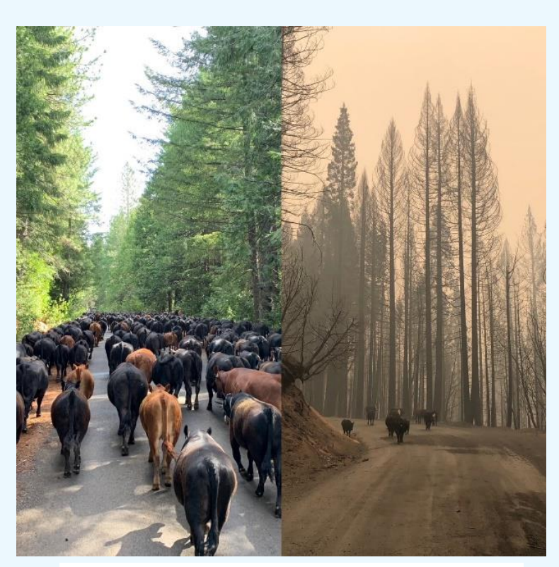
Figure 1: Cattle grazing in Plumas National Forest before and after the North Complex fire.