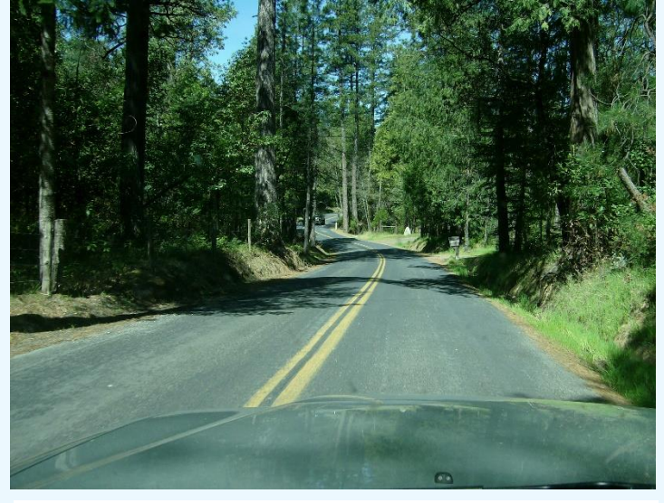
Figure 1: Overgrown roadside fuels in Berry Creek, CA