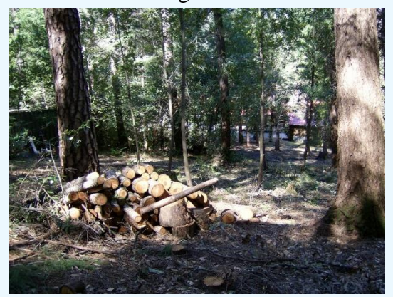
Figure 4: Example of fuel loads in Lake Madrone, Berry Creek.

CERT program, a telephone tree manned by Firewise captains in each area, and a 1950's style knocking on doors. All were in progress, but the fire would not wait for us. What it did show me was what would work and what would not. Early warning can be done by area captains, some of whom were out of the area, but this takes hands. When people are packing up, they don't have time to take cell phone calls or to make them. Landline phones are stationery and in our case the message machines were not working because PG&E had our power off. This meant